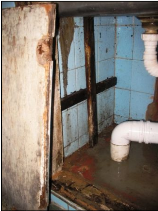
Plumbing problems, the main house kitchen.

main house (our only accommodation for the children at the moment) and the renovation of the big empty barn .