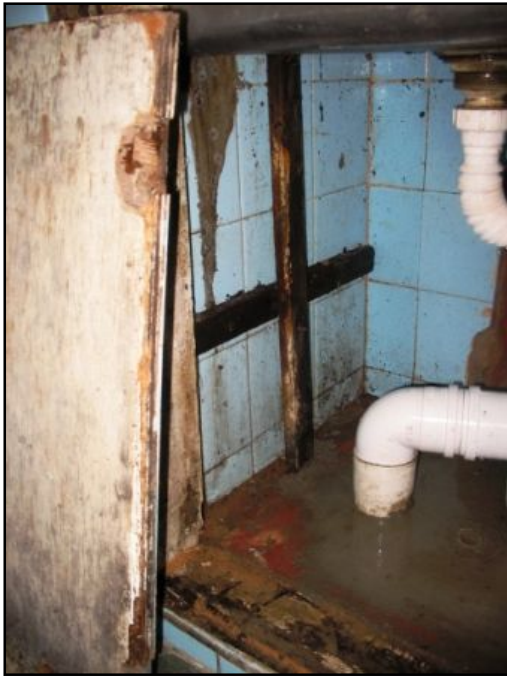
Plumbing problems, the main house kitchen.

main house (our only accommodation for the children at the moment) and the renovation of the big empty barn .