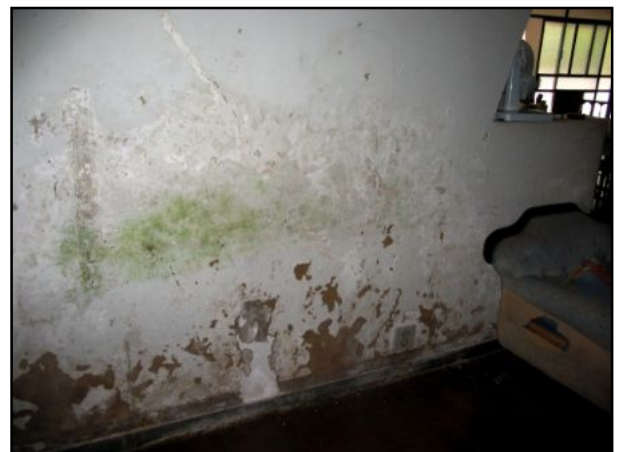
The main house sitting room (similar damp in most rooms).

Two kit chalets , one for single staff/volunteers and one for another staff family. However, two other HUGE priorities, which are becoming more urgent all the time, are the renovation of the